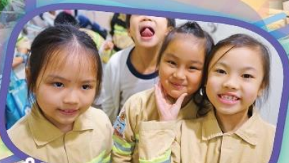
小二消防及救護中心 我們都是小小的女消防員