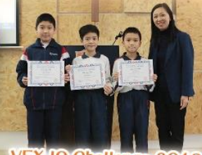
VEX IQ Challenge 2018 HONG KONG Silver Award