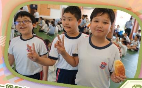
同一個麵包， 有人歡喜有人愁!