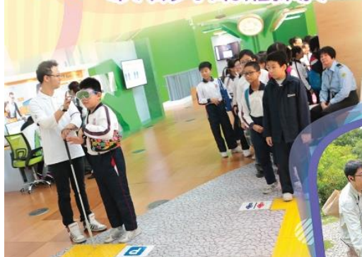
小五參觀零碳天地 在零碳天地感受科技 為視障人士帶來的方便