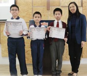
香港工程挑戰賽 1718 小學組季軍