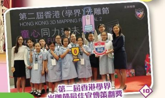
第二屆香港(學界)光雕節 HONG KONG 3D MAPPING FESTIVAL 2 童心同力建未來 MAP THE FUTURE 最佳宣傳策劃獎