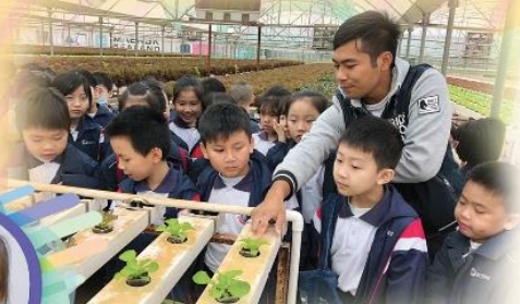
小三參觀水耕種植農場 到水耕種植農場觀察 水耕植物的成長