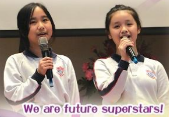
We are future superstars!