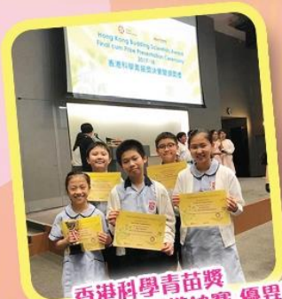
香港科學青苗獎 2017-2018 入選準決賽 優異獎