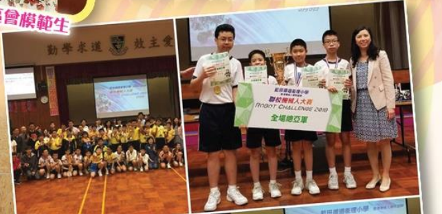
ROBOT CHALLENGE 2018 全場總亞軍機械人足球賽冠軍