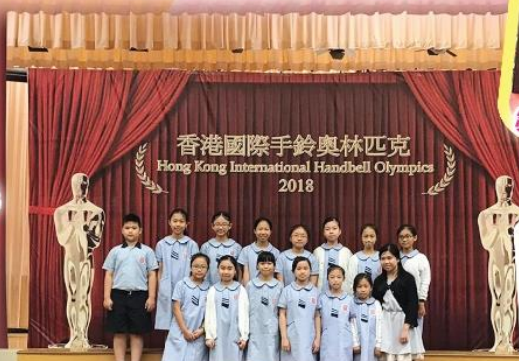
香港國際手鈴奧林匹克 Hong Kong International Handbell Olympics 2018 比賽銅獎