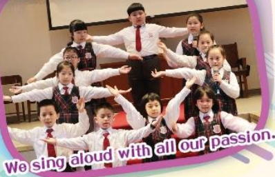
We sing aloud with all our passion.