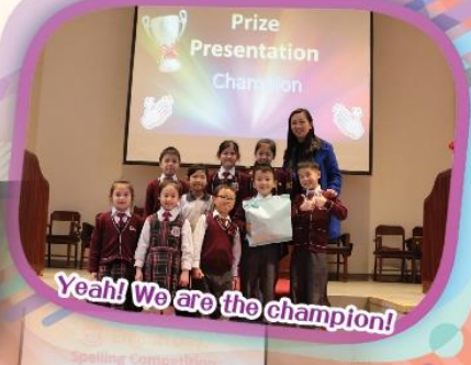
Yeah! We are the champion!