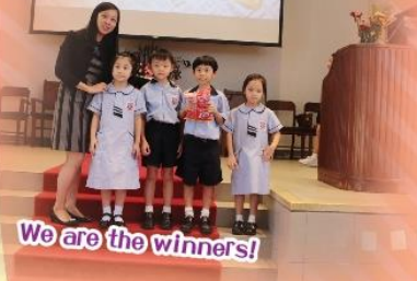
We are the winners!