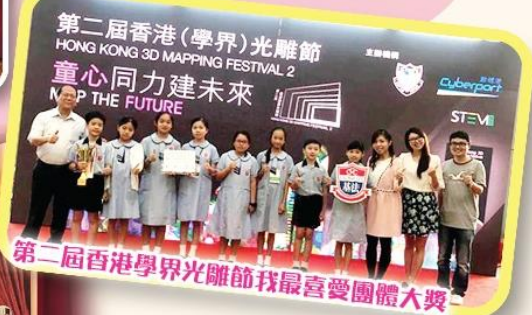
第二屆香港(學界)光雕節 HONG KONG 3D MAPPING FESTIVAL 2 童心同力建未來 MAP THE FUTURE 我最喜愛團體大獎