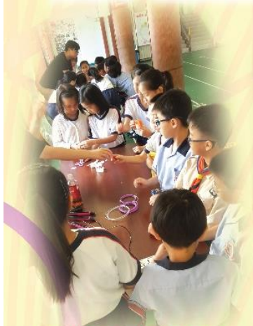
體驗3D Painting 的樂趣

我們又著手改造本校電腦室，成為學生全新的STEM學習空間，建立更大的學習空間讓學生進行探究式學習，以提供最合適的環境和硬件來培養及強化學生的創造力、協作和解決問題能力。