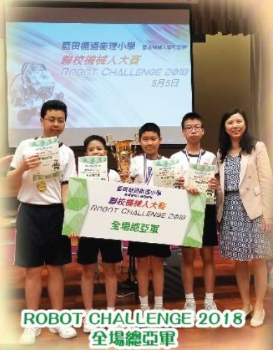
ROBOT CHALLENGE 2018 全場總亞軍