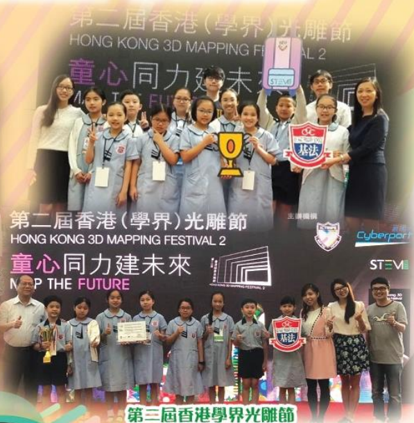
第二屆香港(學界)光雕節 HONG KONG 3D MAPPING FESTIVAL 2 童心同力建未來 MAP THE FUTURE