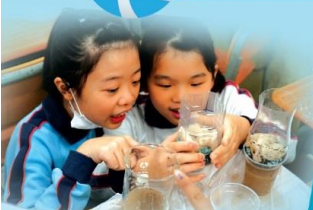
不知道我們製作的濾水器能否將污水過濾？