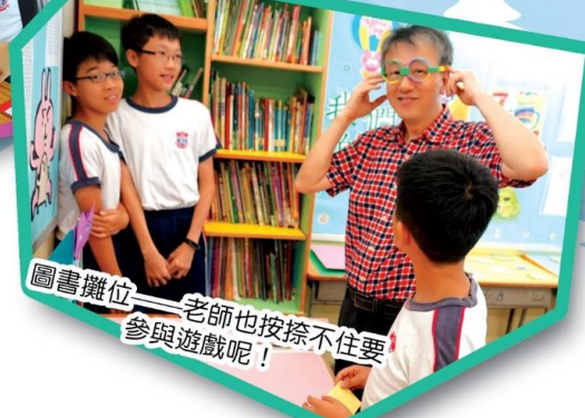
圖書攤位——老師也按捺不住要 參與遊戲呢！