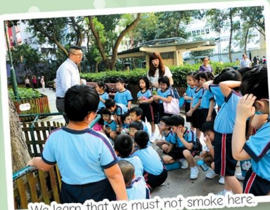
We learn that we must not smoke here.