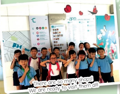
There are so many shops! We are ready to visit them all!