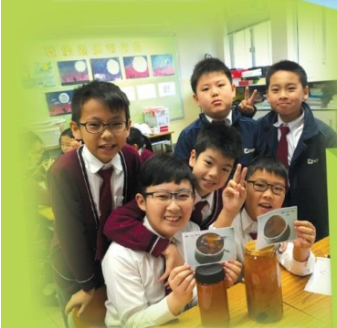
製作湯水也難不到我們