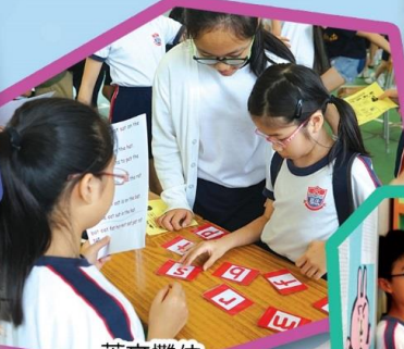
英文攤位—— 該怎樣拼出英文生字呢？