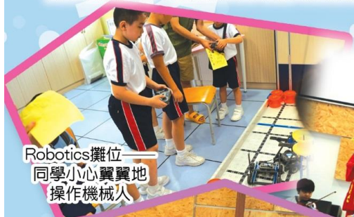
Robotics攤位 同學小心翼翼地 操作機械人

除了才藝表演，當天亦設有不同學科的攤位，讓同學們回顧全年所學，甚至可以挑戰高年級的學習內容，寓學習於遊戲。家長和同學們都玩得很盡興呢！