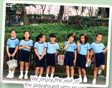
We enjoy the visit of the playground very much!