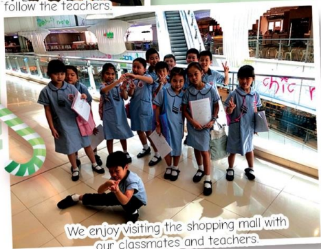
We enjoy visiting the shopping mall with our classmates and teachers.