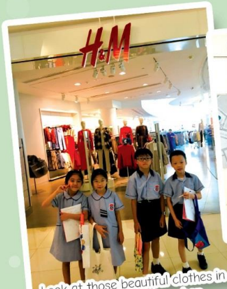
Look at those beautiful clothes in this popular clothes shop.