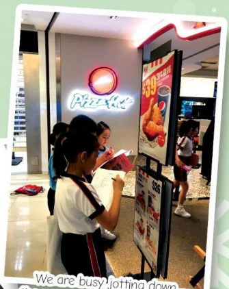
We are busy jotting down the names of the yummy food.