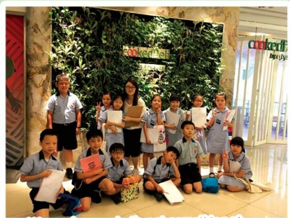
We are hungry. Let's eat something at the food court.