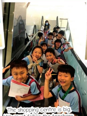
The shopping centre is big. We must follow the teachers.