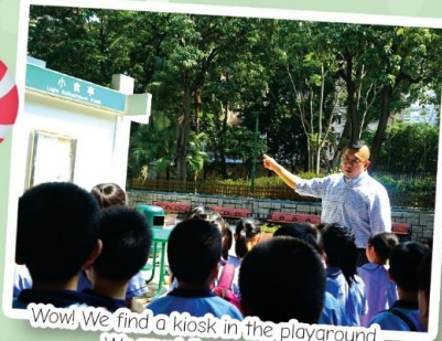
Wow, we find a kiosk in the playground. We must line up there.