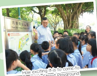
How exciting it is to come to Yuet Wah Street Playground.