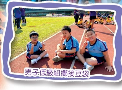
男子低級組擲接豆袋