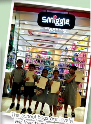
The school bags are lovely! We love them so much!