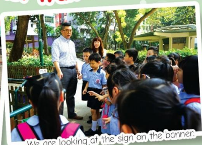
We are looking at the sign on the banner.